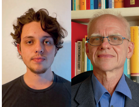
Team works! The first tandems: